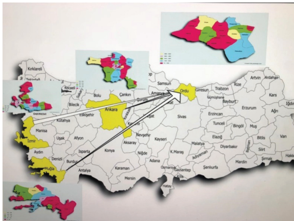
Figure 1: The location of the study area on the map of Turkey and the sampling points,

In order to prepare the bee bread ethanol extract, firstly, a certain amount of powdered bee bread sample was treated with approximately 10 times the